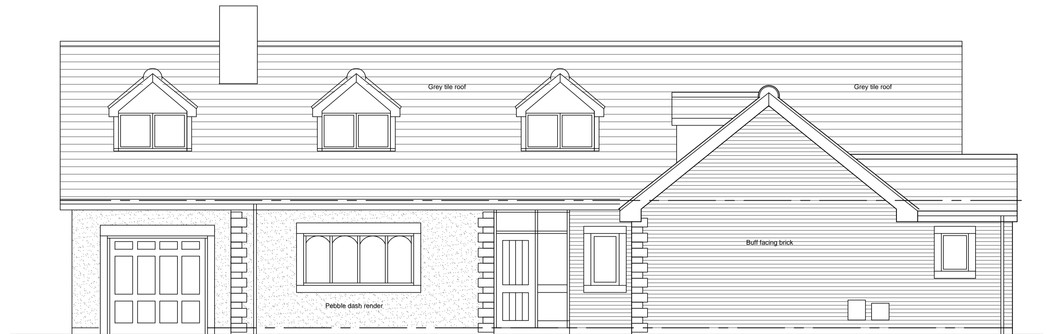
EXISTING FRONT ELEVATION SCALE 1:50

REVISIONS A- 25/09/17 Client name change.