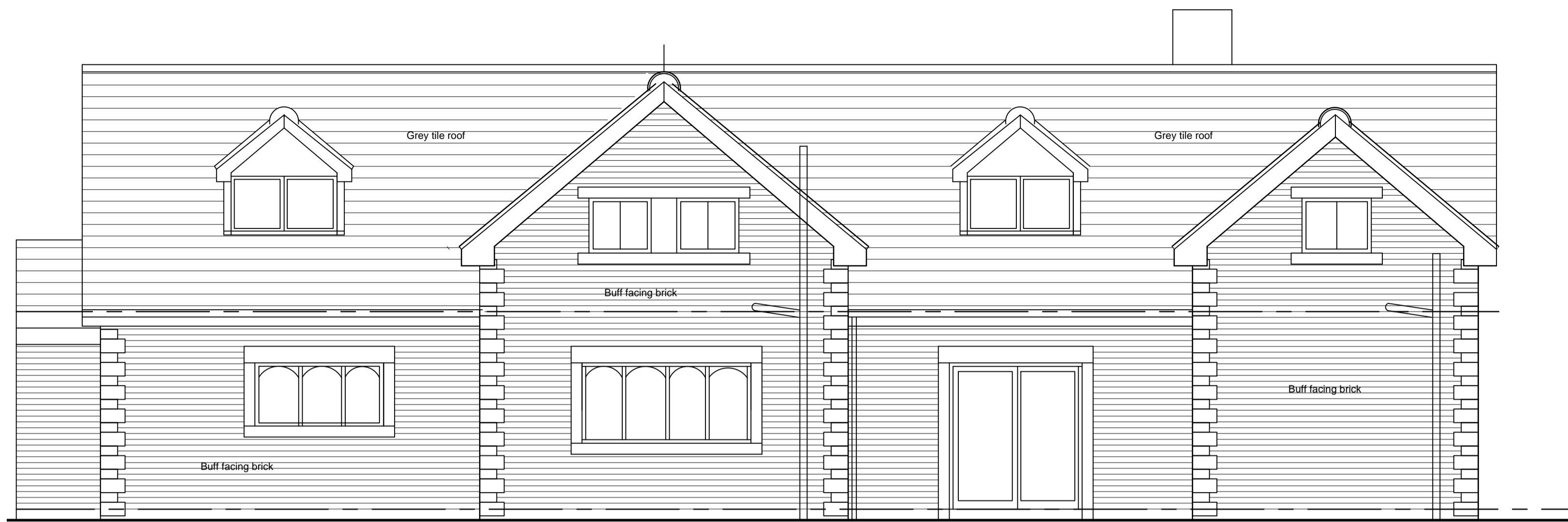
EXISTING REAR ELAVATION SCALE 1:50